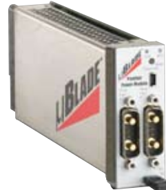
Panther™ 380 Power Module